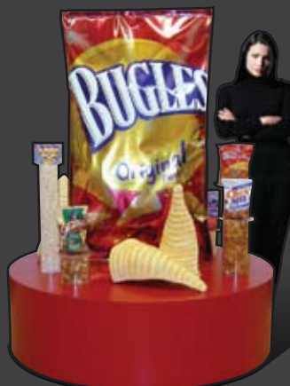
Bugles display from a series of product enlargements for General Mills