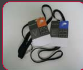
Great Waters name badges