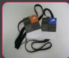
Great Waters name badges