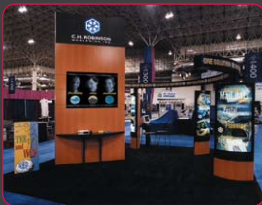
CH Robinson trade show booth