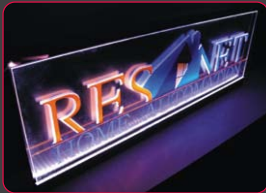
ResNet L.E.D. edge lit acrylic sign