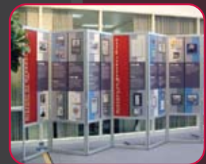
General Mills history display