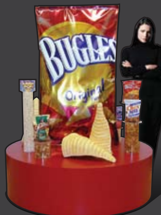
Bugles display from a series of product enlargements for General Mills