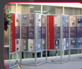
General Mills history display