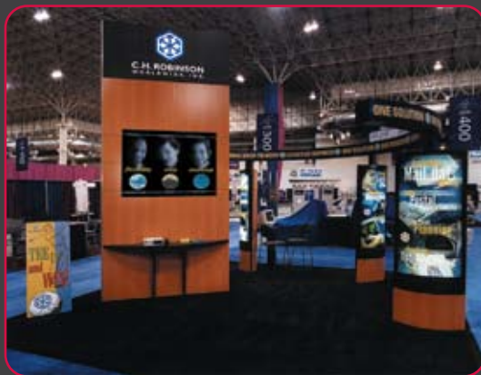
CH Robinson trade show booth