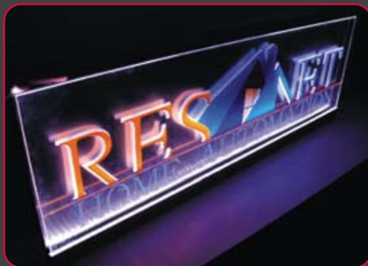
ResNet L.E.D. edge lit acrylic sign